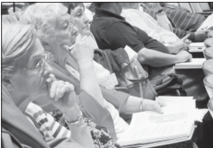
Conference members listen intently during an Imagine Indiana Conferencing Session in Elliott Hall of Music.

The resolution will be discussed and voted on Friday, this afternoon at 4 p.m. Since there are several items to be considered, there will not be a written ballot.