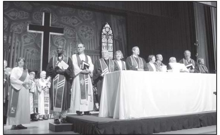
Newly ordained Elders are presented to the 1,000 members of the North Indiana Conference during ordination.