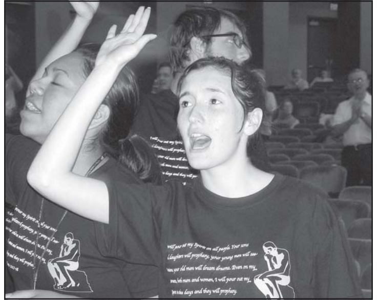
Youth Ministry members add vitality to conference worship.